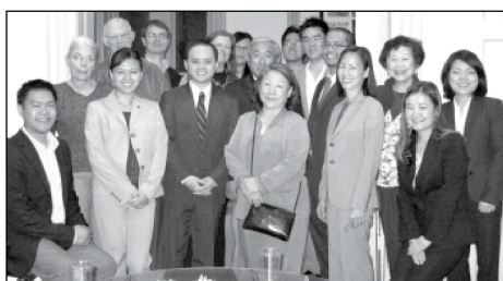
CFJ volunteers, partner organization representatives and congressional aides at JLA Reception after House Judiciary Subcommittee on Immigration hearing in March 2009.

The Japanese Latin American (JLA) Commission bill (H.R. 42/S. 69) made substantial progress in 2009, and Campaign for Justice (CFJ) is feeling very optimistic about its passage in 2010. In February, the bill favorably passed out of the Senate Committee on Homeland Security and is waiting for action by the full Senate.