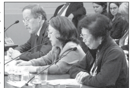
CFJ witnesses testifying in March 2009 at a House Judiciary Subcommittee on Immigration hearing on the treatment of JLAs during WWII.

In March, the House Judiciary Subcommittee on Immigration held a hearing on the treatment of Latin Americans of Japanese and German descent. In July, the bill was favorably passed out of the House Judiciary Subcommittee, followed by its passage