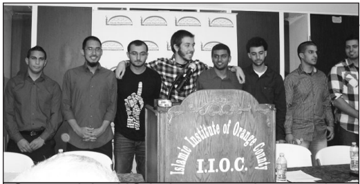
Some of the UC Irvine 11 students and the Orange County Islamic Center Town Hall meeting.