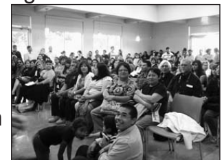
The large and diverse crowd of students, parents and visitors at the East LA County Library screening.